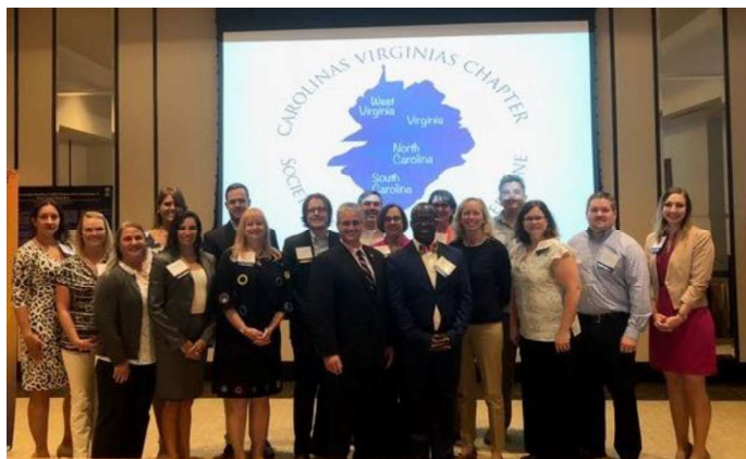
Pictured above: CVCSCCM 2017-2018 Board of Directors

Save the date for the 2019 Annual Scientific Symposium and the Pre-Conference Pharmacology Course, which will be held at Clemson University Center for Nursing, Health Research and Innovation in scenic Greenville, SC on June 6 th -7 th , 2019.